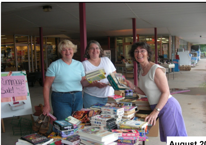
August 20th Y.O.U. Fundraiser Pictures